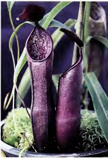
Figure 1: N. sanguinea × N. tobaica cv. 'Shivas Regal'